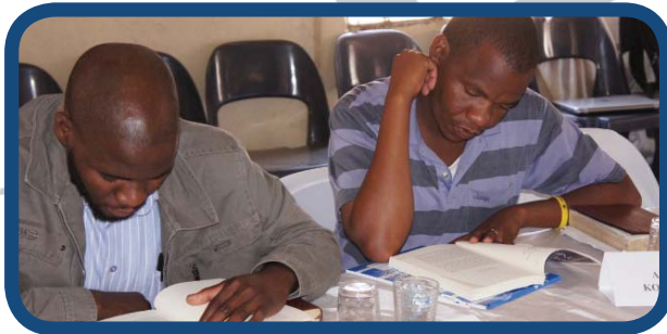
GPA Botswana pastors studying