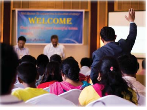
A time of prayer