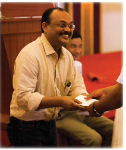
Presenting the love gift