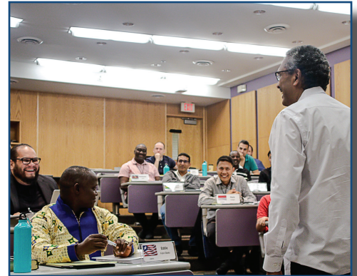
Strengthening...preaching skills learned from the Scripture Sculpture method —a majority of Dallas GPA grads tell us that Scripture Sculpture was the most impactful lesson from the GPA

This is just a glimpse into the lives of the young pastors God brings to each Dallas GPA. They go forward