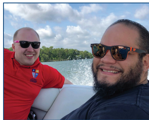
Connecting...through host family weekends